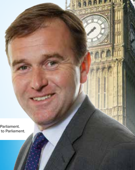
The photographs in this leaflet illustrate the past work of George Eustice as the Member of Parliament. They do not imply that people shown with George either endorse or oppose his re-election to Parliament.